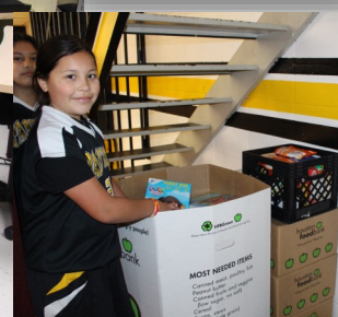
Primary School donations!